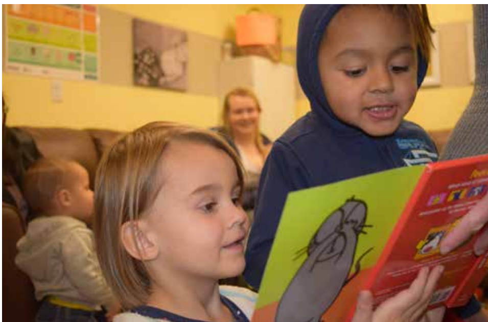
Children discover a new book at Cover to Cover.